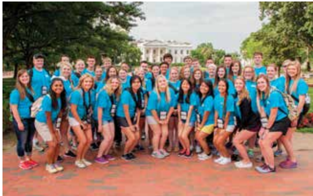
Each year, students from Kansas join more than 1,700 youth in Washington, D.C., to attend the Electric Cooperative Youth Tour. This year's Youth Tour is scheduled for June 9-16, 2016.

Don't Miss this FREE Trip of a Lifetime!