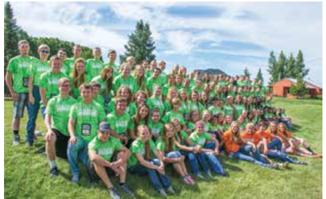
Kansas delegates attend Cooperative Youth Leadership Camp along with students from three other states to develop leadership skills and learn about co-ops. The 2016 CYLC will be July 16-22.

Twin Valley Electric Cooperative, Inc., will send one high school junior to the Electric Cooperative Youth Tour in Washington, D.C., and one to the Cooperative Youth Leadership Camp in Steamboat Springs, CO.